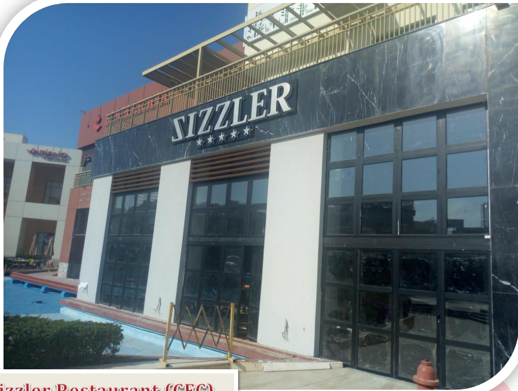
Sizzler Restaurant (CFC)