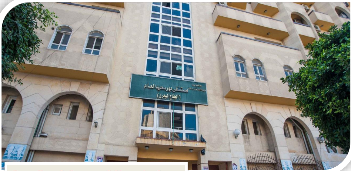
PortFoad General Hospital