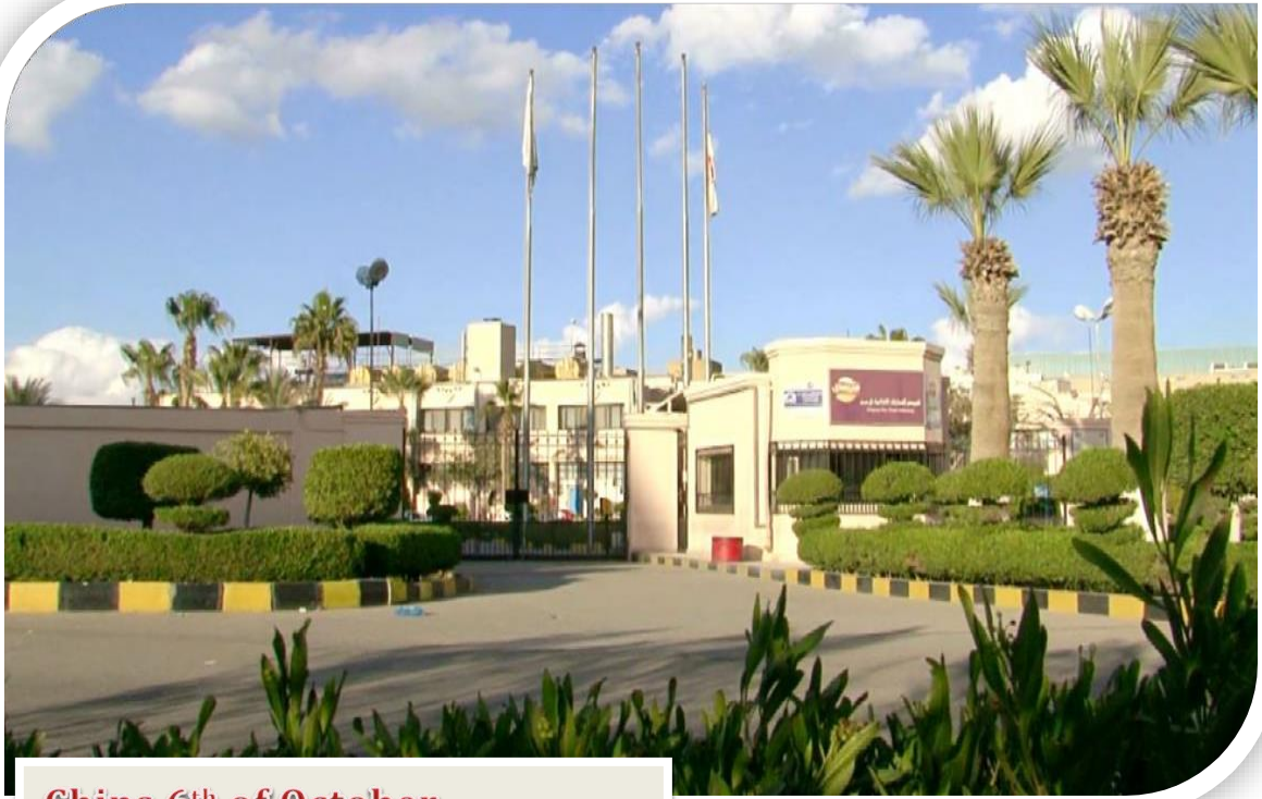
Chips 6 th of October