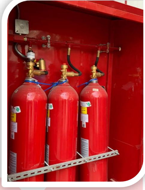
Banque Du Caire