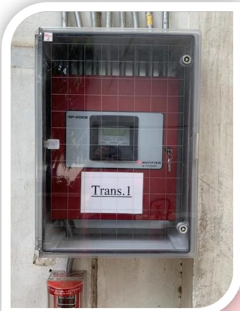
Banque Du caire