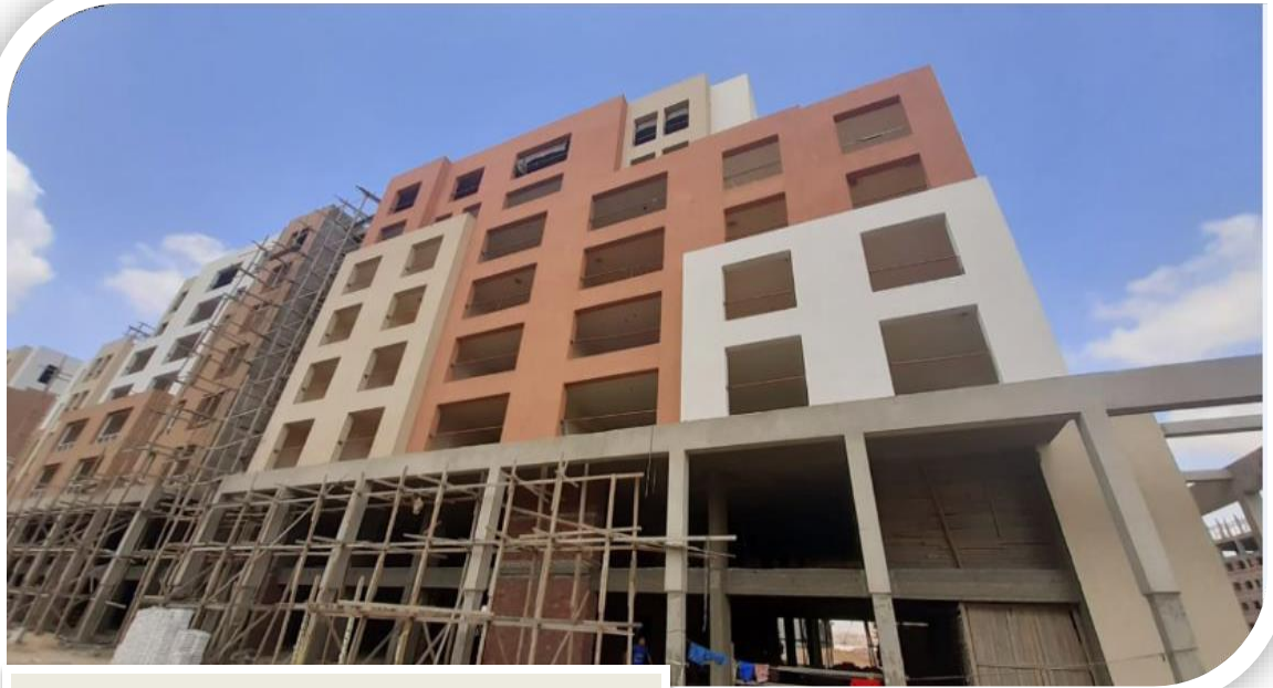
R3 Buildings -New Capital