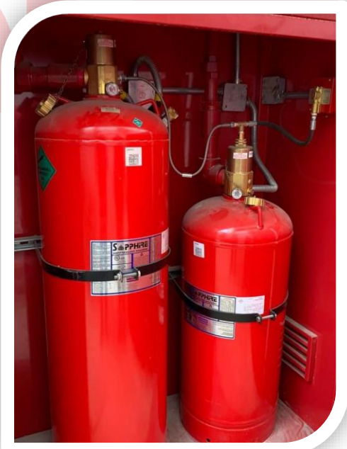
Banque Du caire