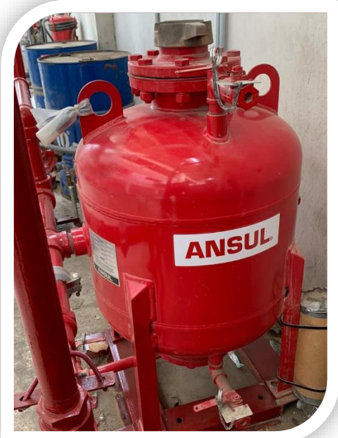
Banque Du caire